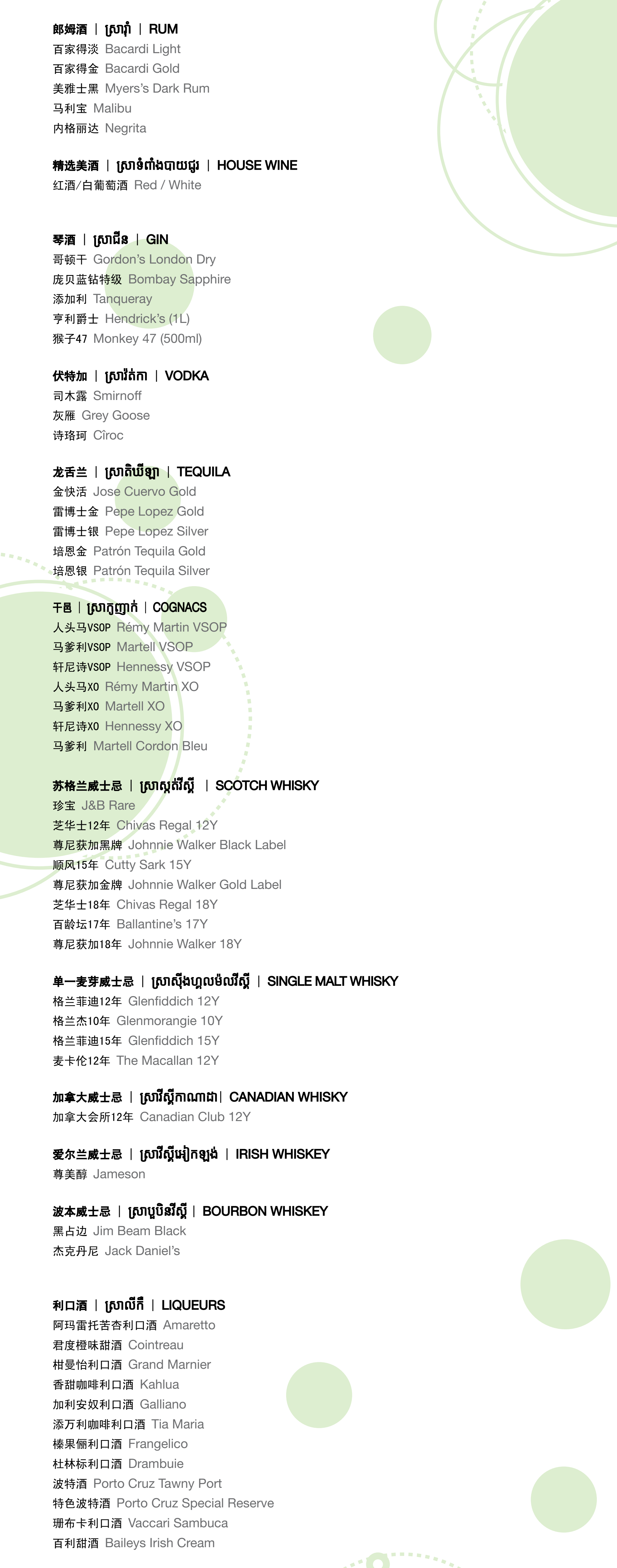
All prices are net and quoted in US Dollars • 所有价格为净并以美元计算

各款甜与咸糕点配咖啡或茶 Afternoon Tea – selection of sweet and savoury delights with choice of tea or coffee