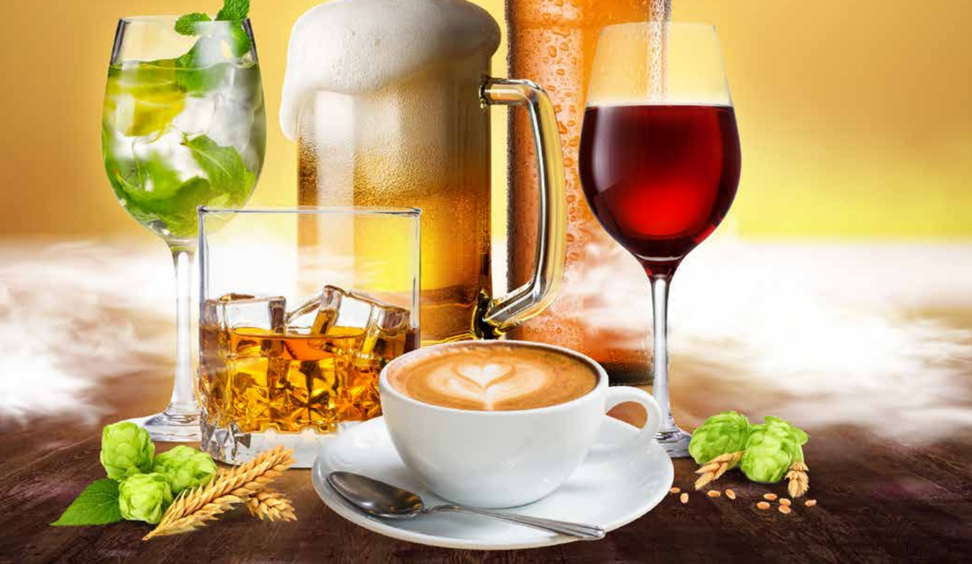
All prices are net and quoted in US Dollars • 所有价格为净并以美元计算